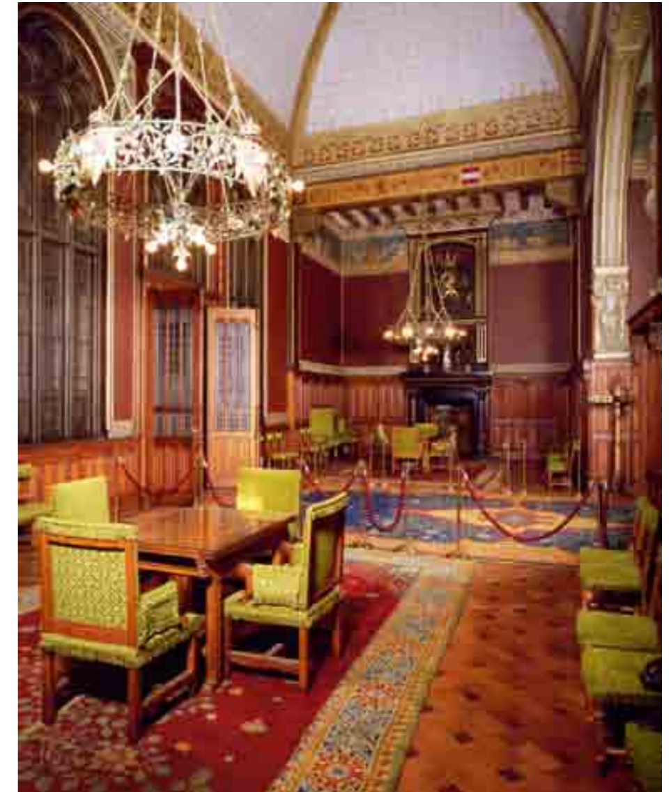
Pierre Cuypers, Great Hall of Royal Waiting Room, Centraal Station, Amsterdam, 1889. Cuypers's design included details such as the parquet floor and carpets